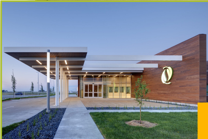
Story County Medical Center